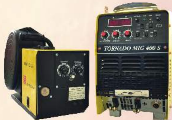
THUNDER-THY MIG 400